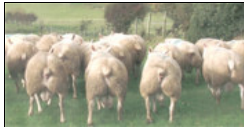
Elwy Valley boys getting ready for the ladies! Note the double muscle on the legs. These rams produce the highest quality meat to bone ratio giving that extra large, succulent rib-eye meat

T his is a premium product, specially selected to go straight from the farm to your fork.