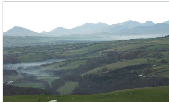
THE VIEW FROM OUR FARM